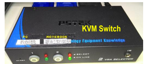
筆電轉接頭 Cable for notebook

Use PC → Press 1 button on the KVM Switch.