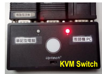
筆電轉接頭 Cable for notebook